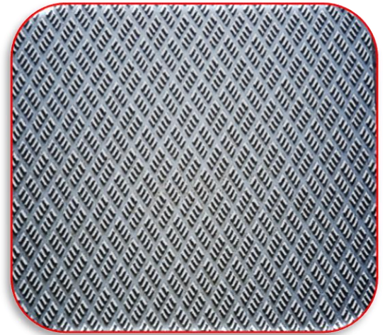
Quadriple is one of the non-skid textures available.

Innovative Panel Technologies can provide the guidance, assistance and experience you need in selecting the appropriate panel for your specific application. Issues related to wear, surfaces that will be covered, useful life and maintenance can and should be discussed in meeting your requirements and needs precisely.