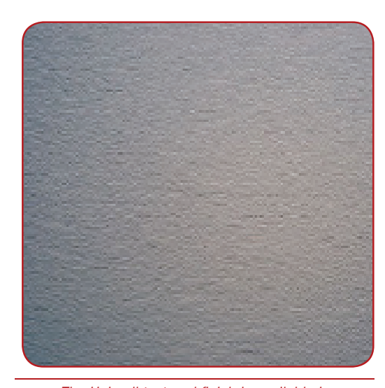
The Haircell textured finish is available in a variety of colors.

1308 NE 134th St., #120 Vancouver, WA 98685 888.560.9909 toll free 360.896.3662 tel