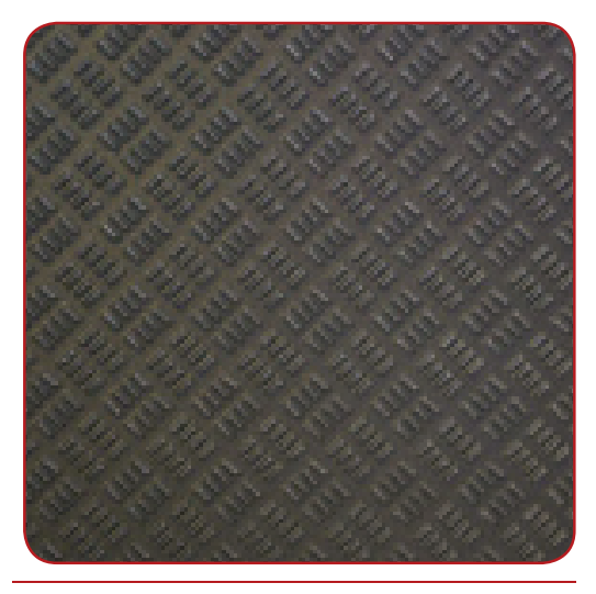
Quadripple is one of several textures available.

Note: your actual weight per wheel loading must be adjusted to compensate for the actual footprint of the wheels to be used.