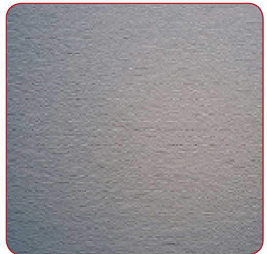
The Haircell textured finish is available in a variety of colors.

1308 NE 134th St., #120 Vancouver, WA 98685 888.560.9909 toll free 360.896.3662 tel