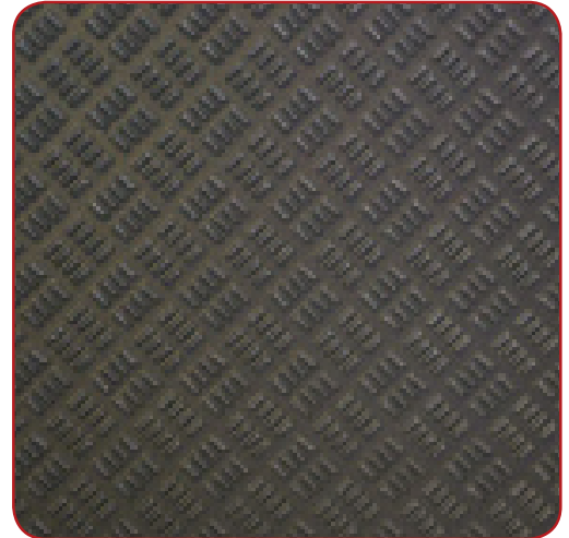
Quadriple is one of several textures available.

Note: your actual weight per wheel loading must be adjusted to compensate for the actual footprint of the wheels to be used.