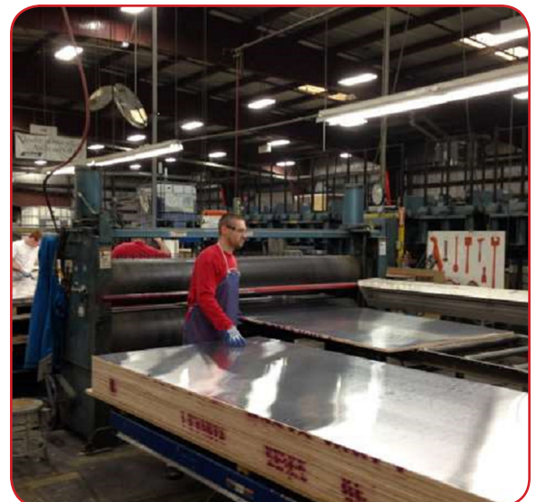
Experienced employees at the production facilities handle all aspects of custom panel production.