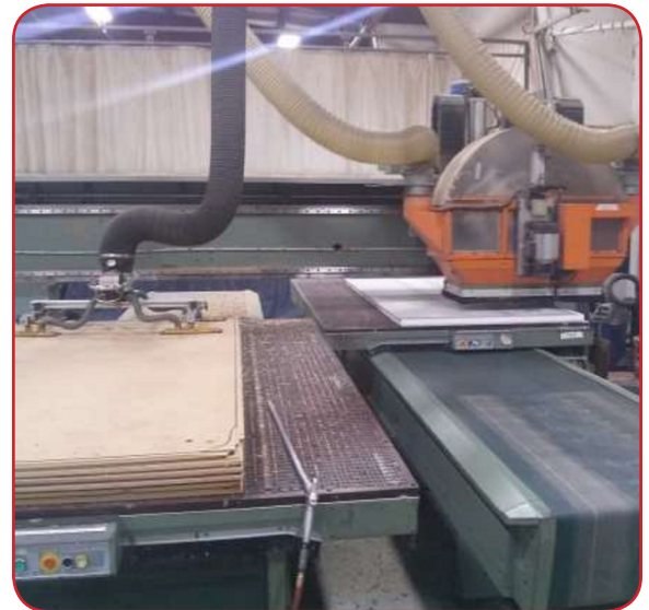
IPT offers the capability to do custom CNC router work from pre-bored fastener holes to more complex patterns such as lettering.