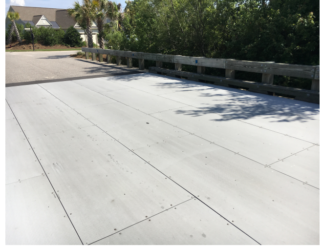
Wooden Bridge 1 Year AFTER I-Tech Armor Plate Was Installed