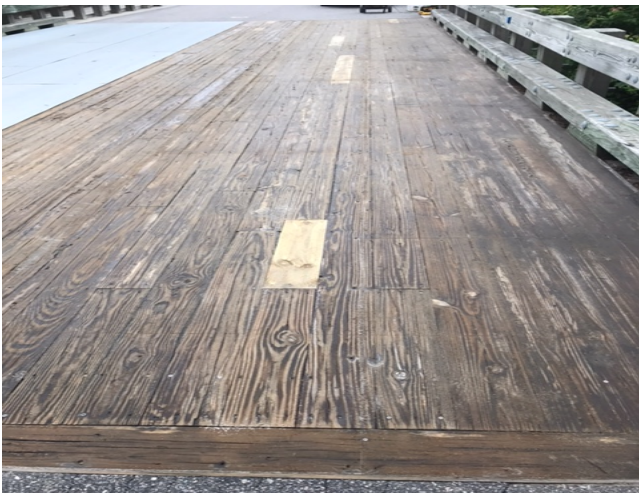
Wooden Bridge BEFORE I-Tech Armor Plate