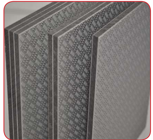
I-Tech Armor Plate HD is available in a variety of thicknesses to meet your wood-free requirements.

Innovative Panel Technologies can provide the guidance, assistance and experience you need in selecting the appropriate panel for your specific application. Issues related to wear, surfaces that will be covered, useful life and maintenance can and should be discussed in meeting your requirements and needs precisely.