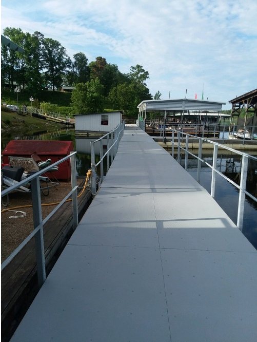
Marina Dock AFTER I-Tech Armor Plate

888.560.9909 toll free | 360.896.3662 tel