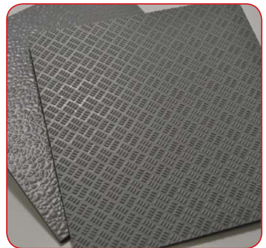
I-Tech Armor Plate is available in a variety of non-slip textures including Cracked Ice and Quadripple.