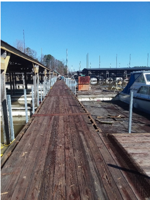
Marina Dock BEFORE I-Tech Armor Plate