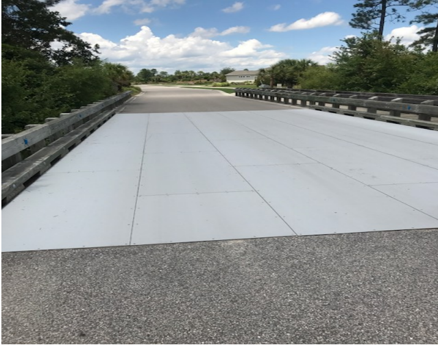
Wooden Bridge AFTER I-Tech Armor Plate

888.560.9909 toll free | 360.896.3662 tel